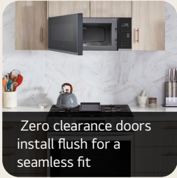
Zero clearance doors install flush for a seamless fit