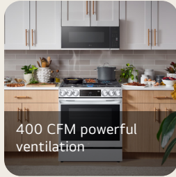
400 CFM powerful ventilation