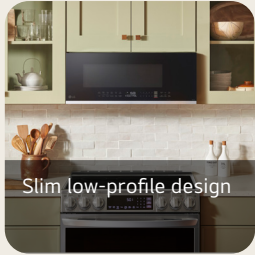
Slim low-profile design