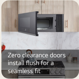
Zero clearance doors install flush for a seamless fit