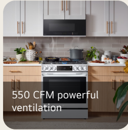
550 CFM powerful ventilation